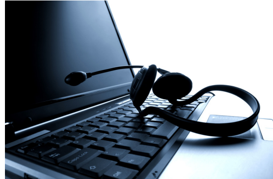
Professional hotline service

With its team of experienced specialists for each automotive subject AuDaCon offers a target audience oriented and professional support. Requirements of the ordering customer are considered with monthly reports. Questions rising from fault diagnosis and technical problems are solved in cooperation with the AuDaConEXPERT team.